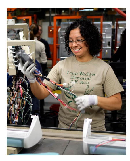
2022 Global Goal: Zero Manufacturing Waste to Landfill. 3 plants in Brazil have already met that goal.