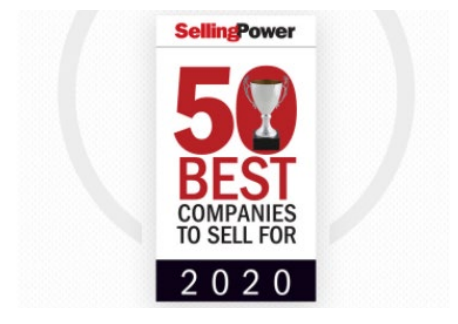
Whirlpool Corporation Once Again Achieves High Ranking on Selling Power's Annual "50 Best Companies to Sell For" List in 2020