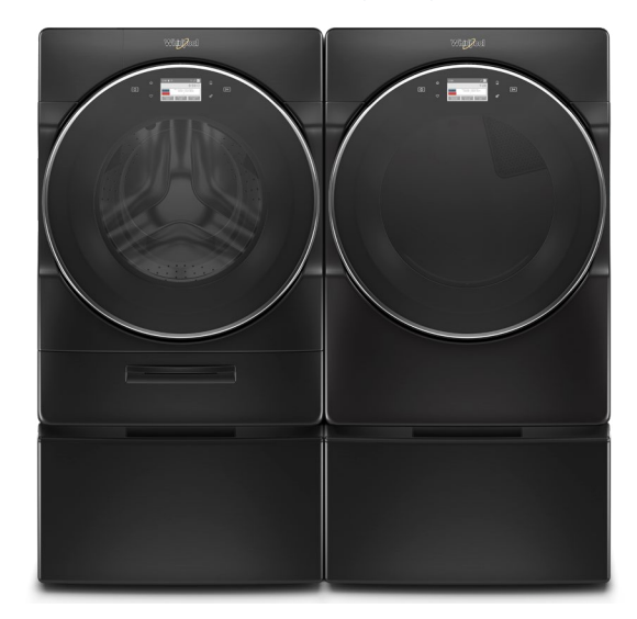
Our products around the globe use significantly less water and less energy than prior models