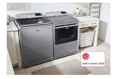
Maytag brand's top-load laundry line has proven to be a winner, recently receiving the prestigious Red Dot designation for design .