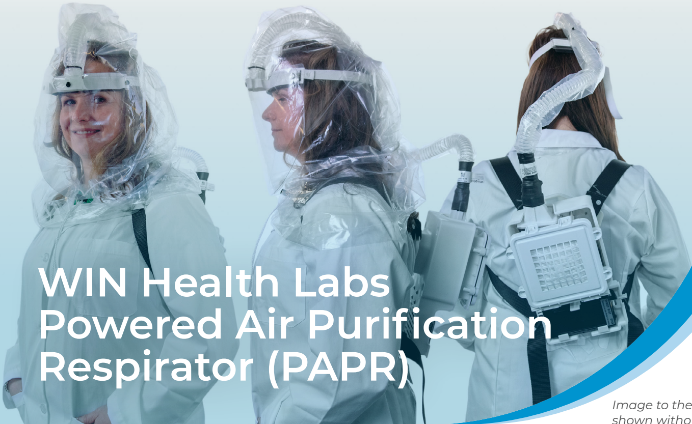
Image to the right, shown without hood

A joint project to help provide much-needed respirators to the heroic men and women in healthcare who are working on the frontlines to combat the spread of COVID-19.