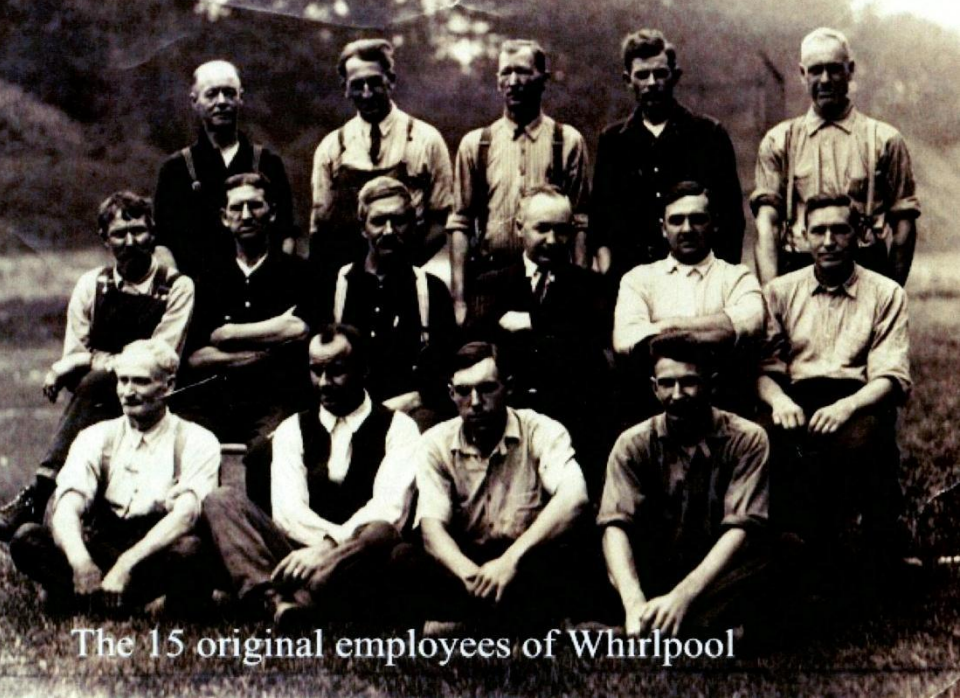
The 15 original employees of Whirlpool